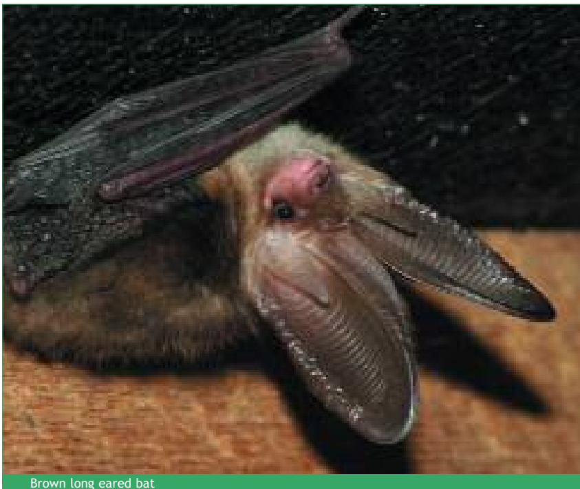
Brown long eared bat

Should you wish to contact the Aspire Environmental Team please do so via