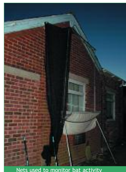
Nets used to monitor bat activity

creating wildlife corridors. In other agreed areas, seed from Salisbury Plain will be sown to recreate calcareous grassland, which is widely recognised as of national importance in terms of biodiversity.