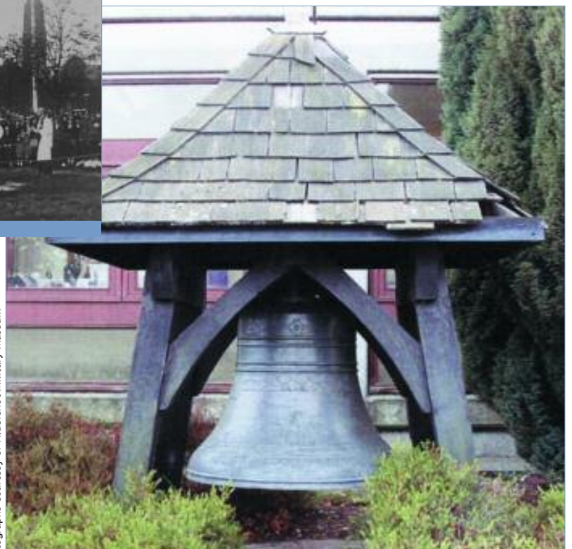
The Sebastabol Bell