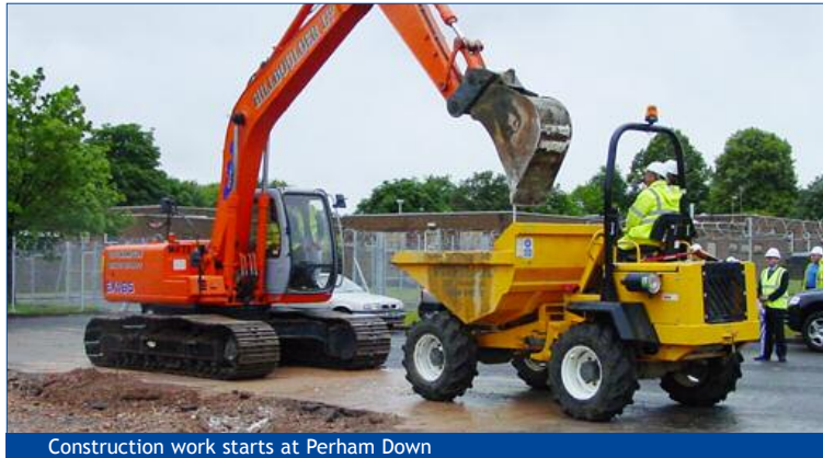
Construction work starts at Perham Down

"We are very proud to be the sponsor of the Aldershot show in this, the 150th Anniversary year of the Army in Aldershot".