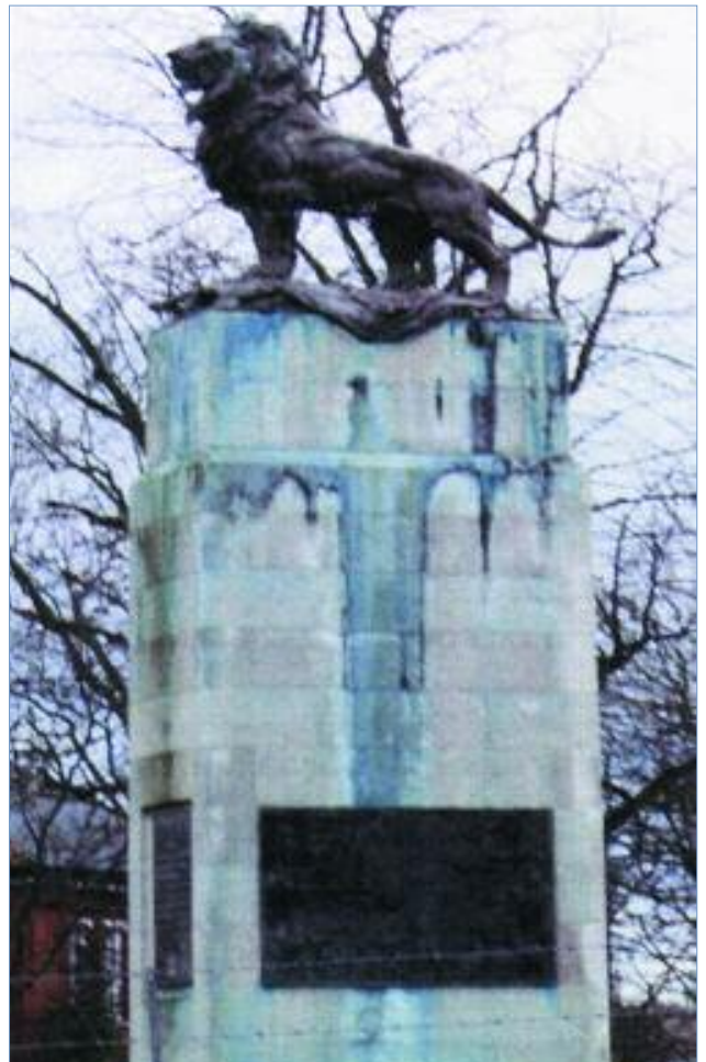
The Memorial today