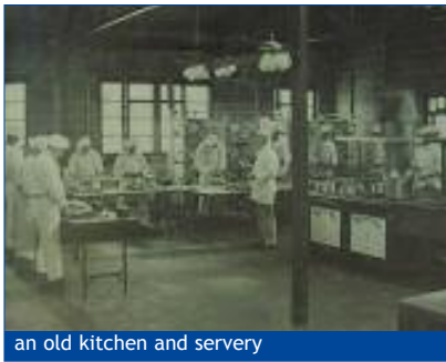
an old kitchen and servery

The expression 'an army marches on its stomach' could not be more relevant for Sodexho - the provider of catering services to the Army. With 850 or so of its staff based at Aldershot, Sodexho is proud of its association with the Army. Sodexho will typically provide 30,000 meals per day which are designed to meet the active soldier's dietary requirements.