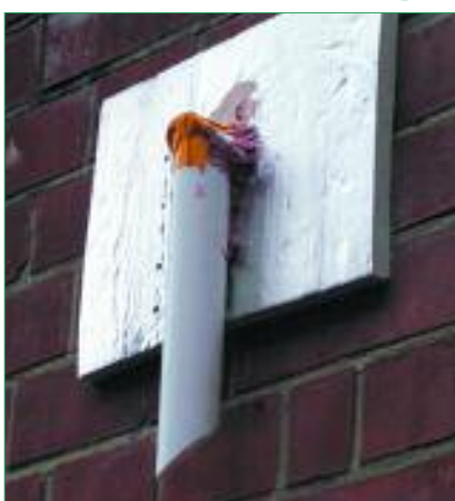
Bat exclusion - used to allow bats to leave buildings but not re-enter

Much of the focus on Project Allenby/Connaught is on what can be seen - what is changing on the ground through redevelopment. However, much of the focus of the Aspire environmental team is on ensuring that what we cannot see remains that way.