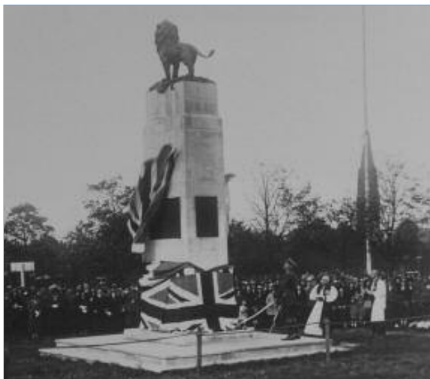
Unveiling of the 8th Division War Memorial in 1924