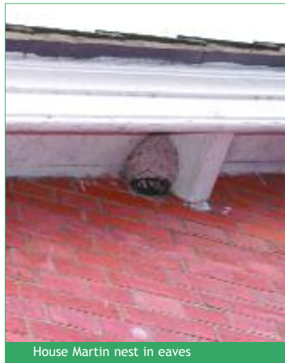
House Martin nest in eaves