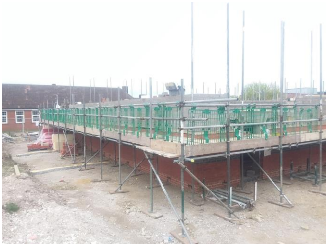
Construction works at Bulford