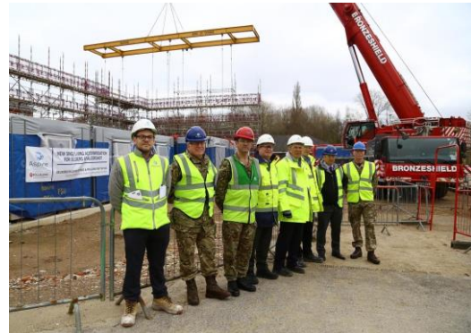
Personnel from ABP, Larkhill Garrison and Aspire in attendance at the Aldershot SLA media event

The arrival of Single Living Accommodation (SLA) Modular Units took place at Aldershot Garrison on Tuesday 14 March, contributing to a critical phase within the build programme to provide more than 2,600 bed spaces for Service personnel returning from Germany.